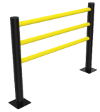
DELTA 3 BEAM